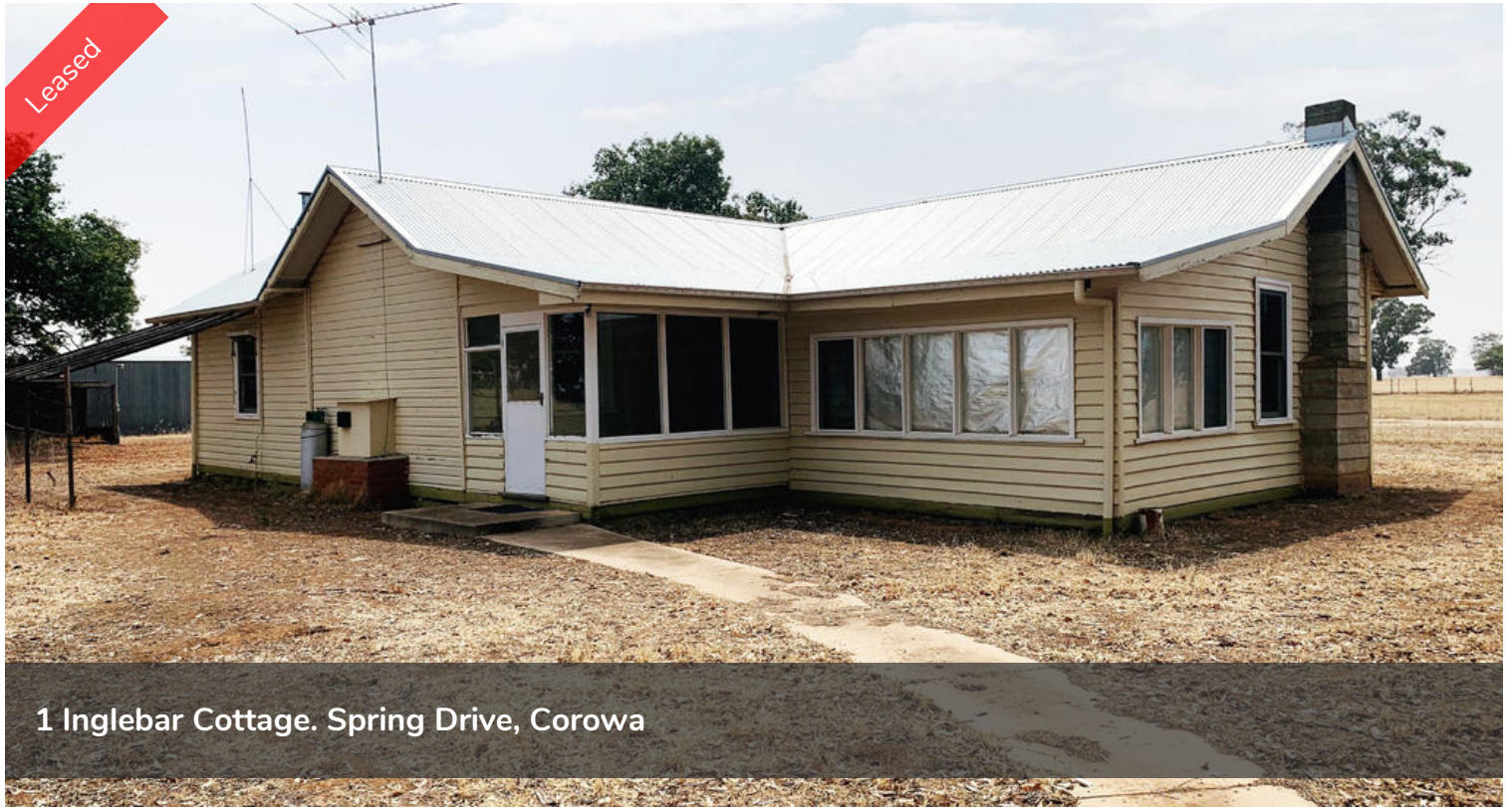
1 Inglebar Cottage. Spring Drive, Corowa