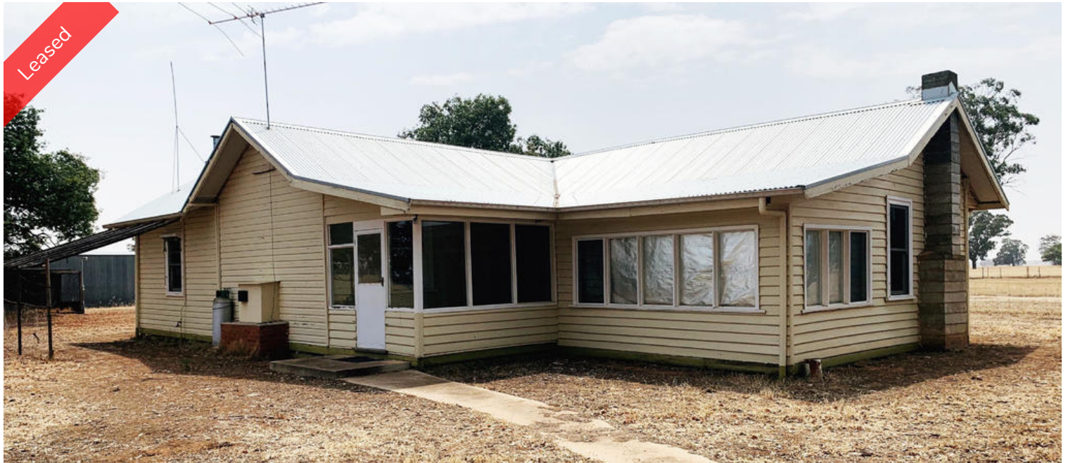
1 Inglebar Cottage (Spring Drive), Mulwala