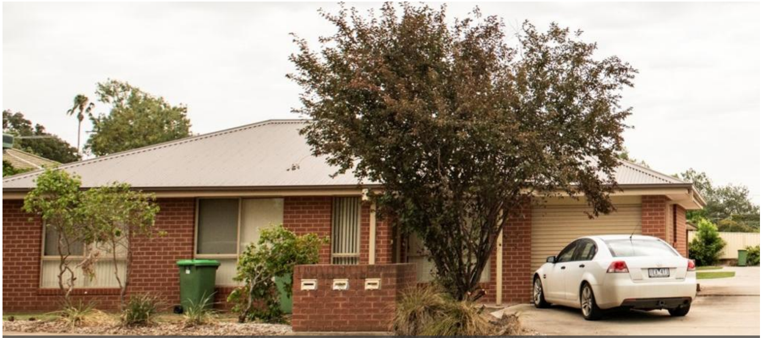
Unit 1, 15-17 Herbert St, Rutherglen