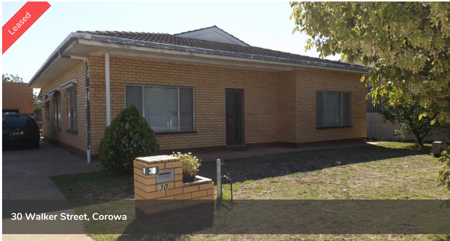
30 Walker Street, Corowa