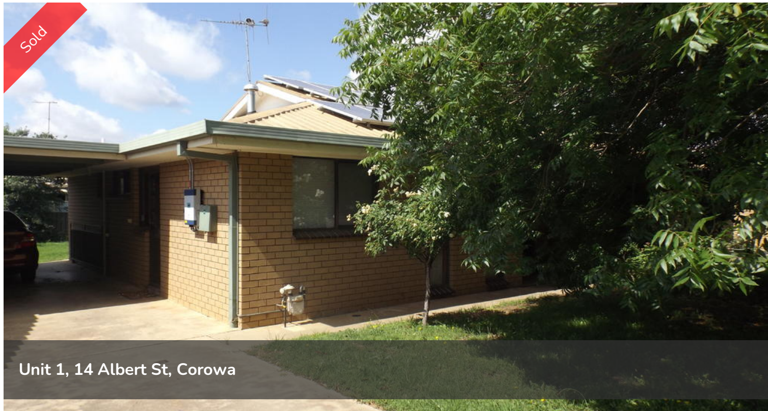
Unit 1, 14 Albert St, Corowa