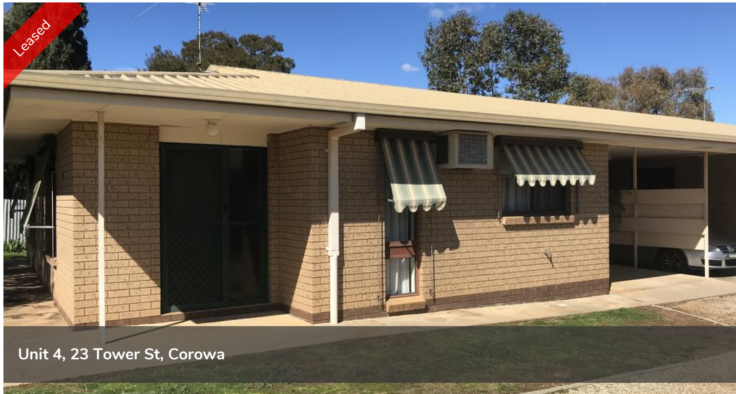
Unit 4, 23 Tower St, Corowa