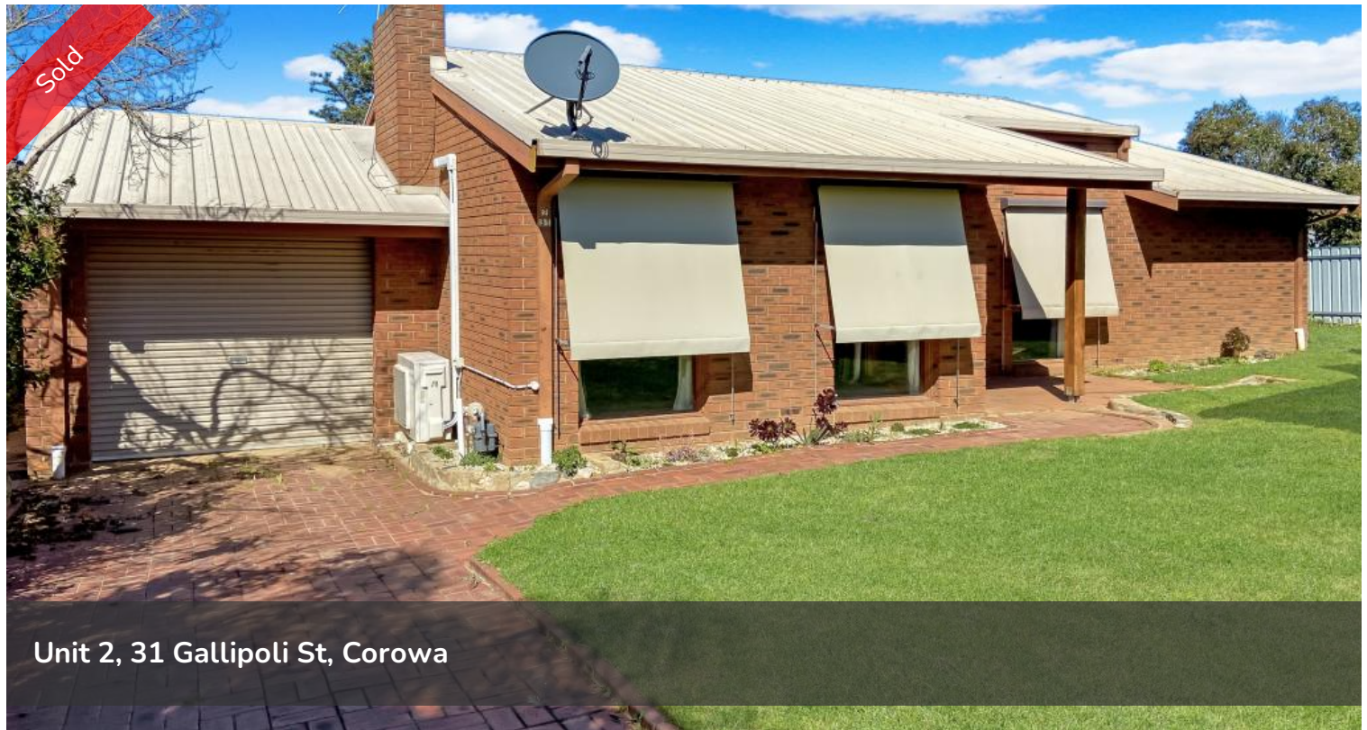
Unit 2, 31 Gallipoli St, Corowa